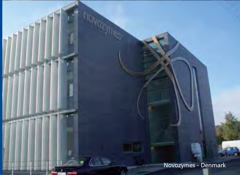
Novozymes - Denmark