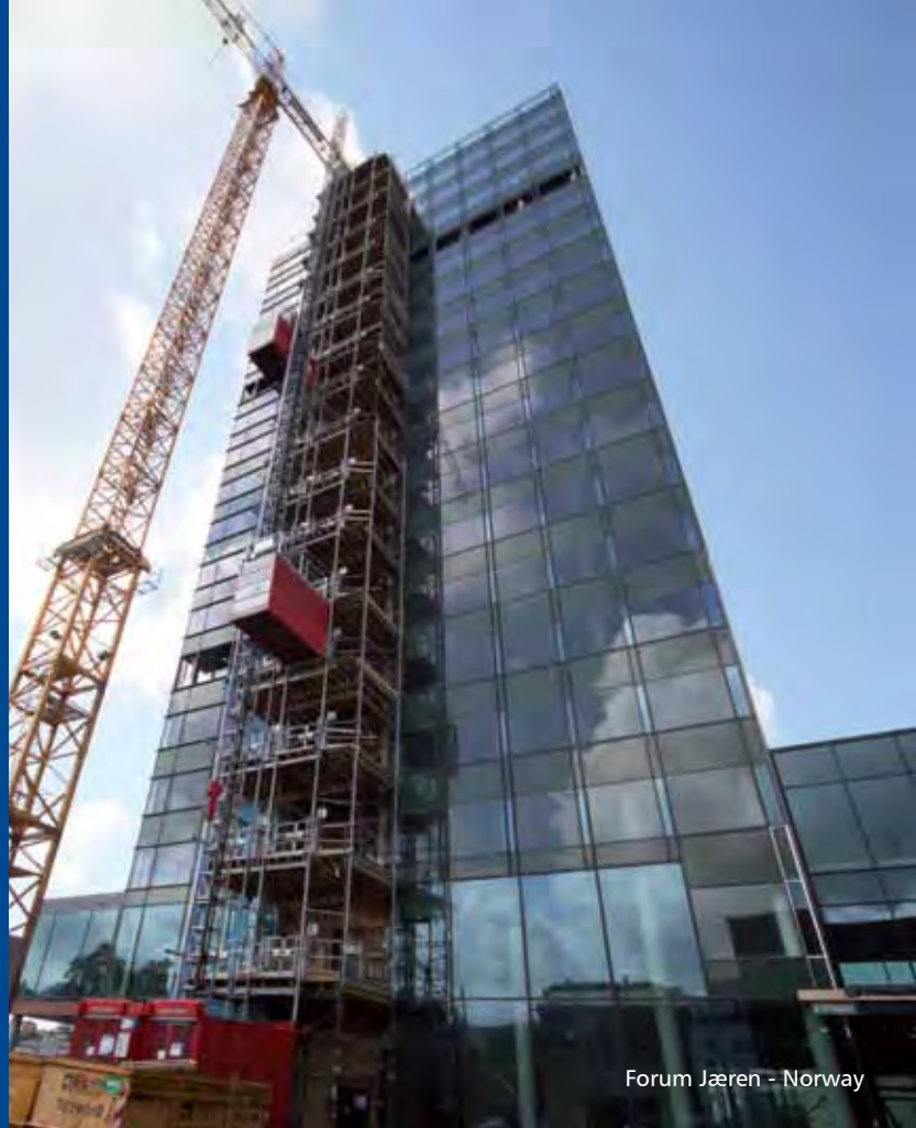
Forum Jæren - Norway

Another Hansen Unital project which is in the planning phase is the new "Rezidor Park In Flyplasshotell" (Airport Hotel) in Norway.